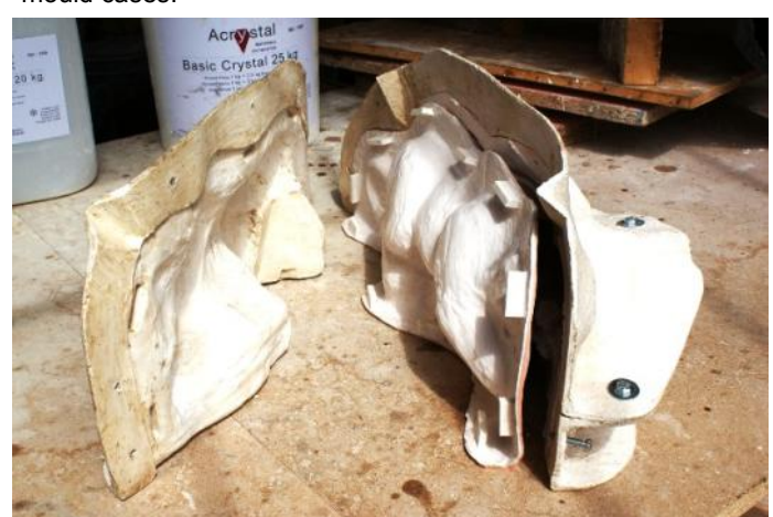
Fine mould case - Frédéric Vincent

Acrystal Prima is the ideal product for the production of light mould cases. The absence of shrinkage avoids the deformations of the mould cases during drying. Therefore it's not necessary to provide metal reinforcements even for large size mould cases.