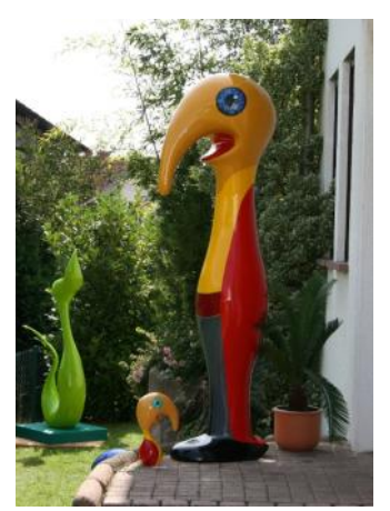
Haptikuss - 2 layers of acrylic paint + 2 layers of glossy varnish - Silvia Baumer

ATTENTION: Apply finishing products only on perfectly dry items (minimum 72 hours drying) in order to avoid blister problems.